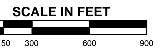
LOCATION MAP SECTIONS 10 AND 11, T28N, R19W, TOWN OF TROY, ST. CROIX COUNTY, WISCONSIN

LOT 2 C.S.M. VOL. 13 PAGE 3629 DOC. #602247